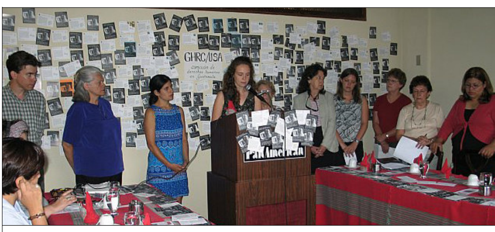
Delegates participate in a press conference condemning violence against women

personal, and so taxing on every person. single commis-Truth sions after the war in Guatemala estimated 200,000 that people were killed or disappeared during the war, but hurights man