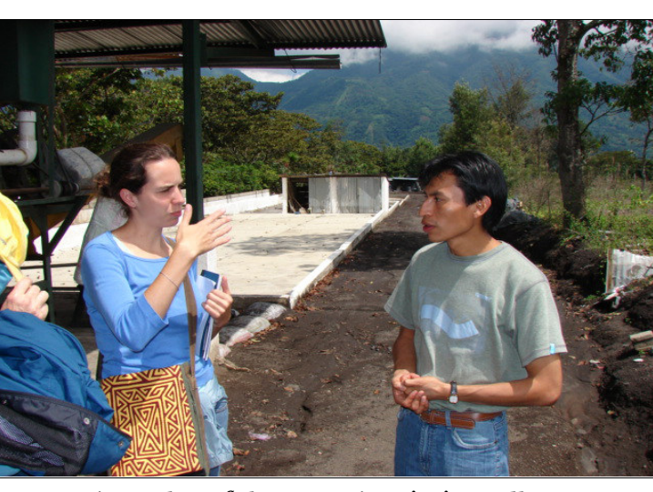
A member of the Maya Association talks to the group about development and reconstruction efforts

When Hurricane Stan hit Guatemala in October of 2005, the areas hardest hit by the storm were among Guatemala's poorest indigenous communities. During the delegation, we visited Tzanchaj, a Tz'utuhil community on the banks of Lake Atitlán. Almost ten months after the disaster, we could still see the tracks of the mudslides that had buried an esti-