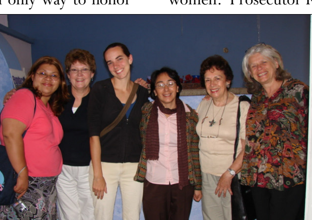
Delegates with a member of the Survivor's Foundation

In spite of the authorities' apparent conviction, the groups that we met with had other perspectives. A woman from the midwife's association explained that the media attributes the crimes to gang violence without reporting on the whole story. "A report will just say a woman was killed but it won't mention that she was raped," she said. A woman at Nuevos Horizontes offered, "They say it's the gangs, but it's not the gangs. It's the lovers and boyfriends." The Network of Nonviolence Against Women estimates that one-third of the murders are related to domestic violence.