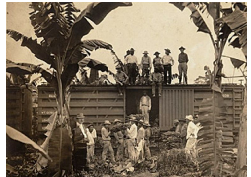
UFCo workers unloading bananas