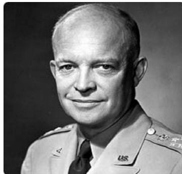
Above: President Dwight D. Eisenhower