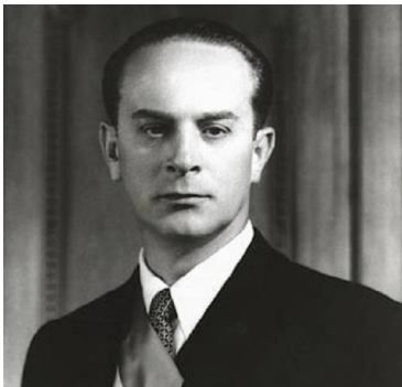
Above: President Jacobo Arbenz Gúzman