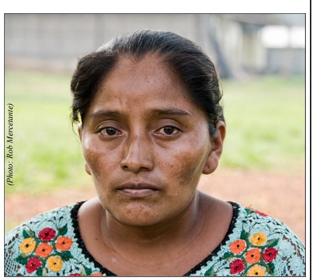
The lives of hundreds of indigenous men, women and children are at risk today in the Polochic Valley

The Maya Q'eqchi' population was displaced, and often forced to work for slave wages on the large plantations. Tensions between the large landowners, many of German descent, and the local indigenous population increased as the communities struggled to win legal recognition of their historic claims to the land.