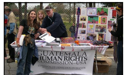
GHRC volunteers table at SOA rally