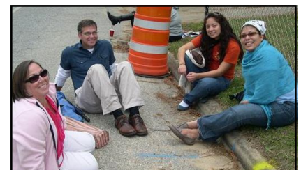
GHRC March 2009 delegates reunite outside of Fort Benning

prison and probation sentences of up to two years for their acts of nonviolent civil disobedience. 2