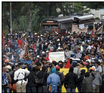
Thousands of citizens of San Juan Sacatepéquez march to the Presidential Palace in protest of the mine, July 13, 2009

The protesters say they have simply been exercising their right to contest the mis-