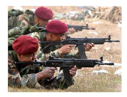
Kaibiles going through intense 60-day training

3321 12th Street NE Washington, DC 20017 // Tel: (202) 529-6599 // www.ghrc-usa.org