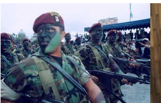
Kaibiles Motto: "If I advance, follow me. If I stop, urge me on. If I retreat, kill me"