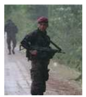
US Marines training with Kaibiles in Petén, Guatemala