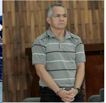
Former Kaibil instructor sentenced to 6,060 years in prison