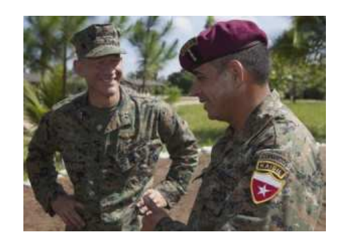
Guatemalan Army Colonel with U.S. Marine Major General

Founded in 1982, the Guatemala Human Rights Commission/USA (GHRC) is a nonprofit, nonpartisan, humanitarian organization that monitors, documents, and reports on the human rights situation in Guatemala, advocates for survivors of human rights abuses in Guatemala, and works toward positive, systemic change.